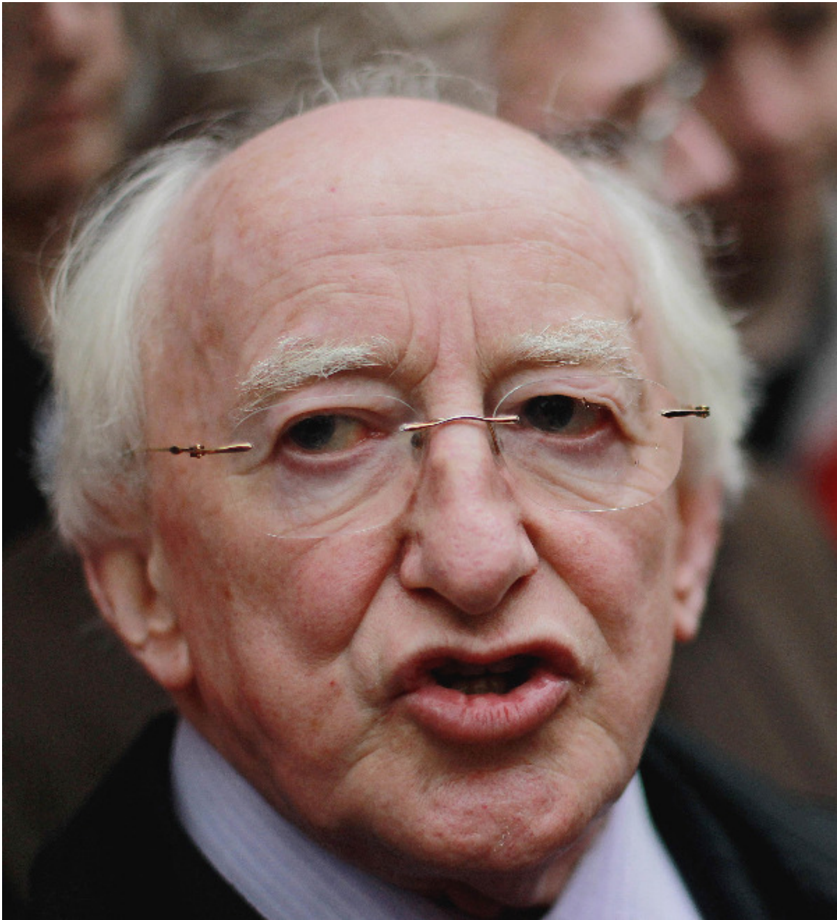
Michael D. Higgins

The Poet King Occupy Spring St. Linnea 2005 YU-55