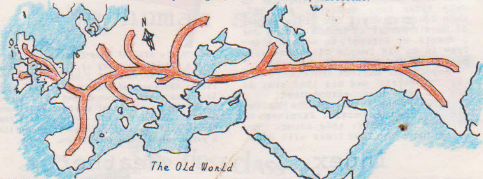
The Old World

The RED CROSS is just the reverse of the Swiss flag. Like Ireland, France, Austria and Hungary, Switzerland used to be a druid country. The simple crosses of formerly druidic places are identical to our ancient symbols for the Sacred Crossroads and Holy Trees. Elsewhere in Christendom crosses are utterly different.