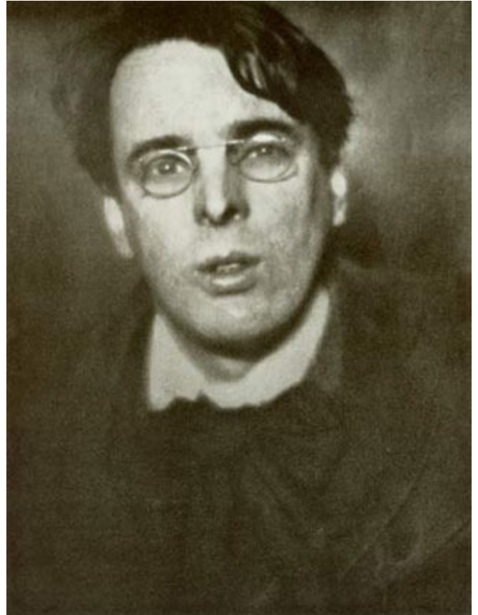
William Butler Yeats and his Celtic Twilight re-popularized Druidry. He is the Ceremonial Godfather of the AR*ID sect.

The classes start tomorrow morning at twilight in Dublin. Bring a notebook and 2 #2 pencils. As in any class, there is no chewing gum and if you are tardy you will be kept after class. You do not even want to know what was done to tardy students before the Reformation*!